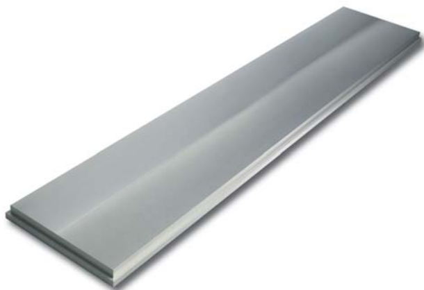
TiAl sputtering target

Other targets in accordance with customers' specifications are available on request.